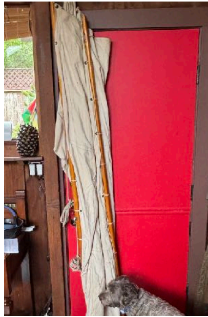
Sail under inspection