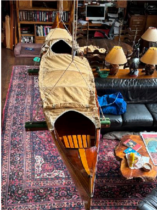
View of spray cover (not fastened in place)