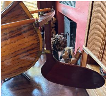
Rudder & tiller pole set up for sailing.