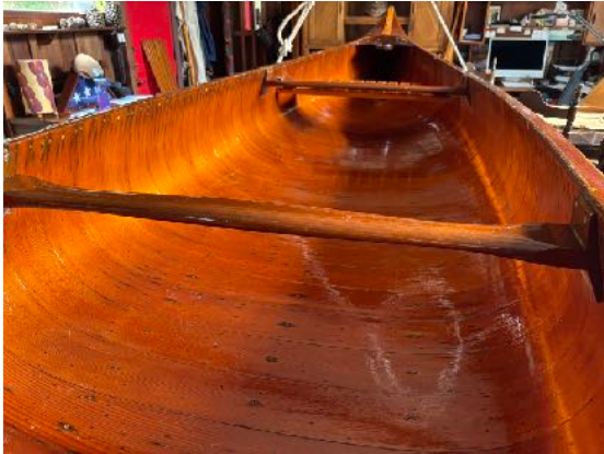
Interior looking forward