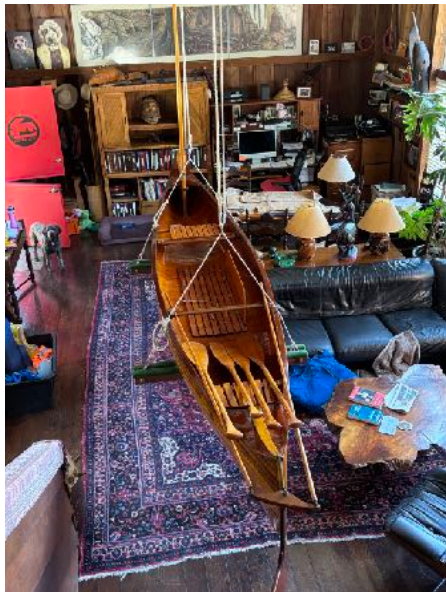
Overview—Ain't she a beauty?

Set out below are current images of No. 952 and the equipment that will come with her to a new home. Every item shown is original Willits Bros. In viewing them, please keep in mind that the pictures have been taken while she is still in her cradle that hangs from my living room ceiling, preventing me from raising her sail or properly affixing the spray cover. All this equipment remains in excellent and usable condition: