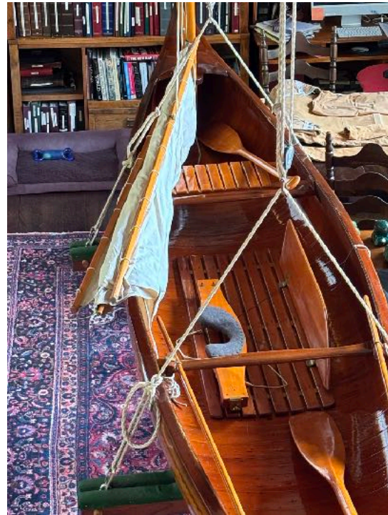
Overview showing sailing kit