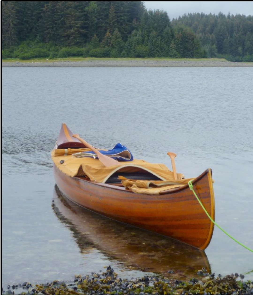
Voyaging Mode—launching for the top of Muir Inlet, Glacier Bay, Alaska 2011