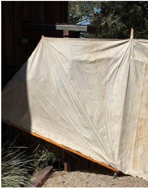
Partial view of butterfly sail