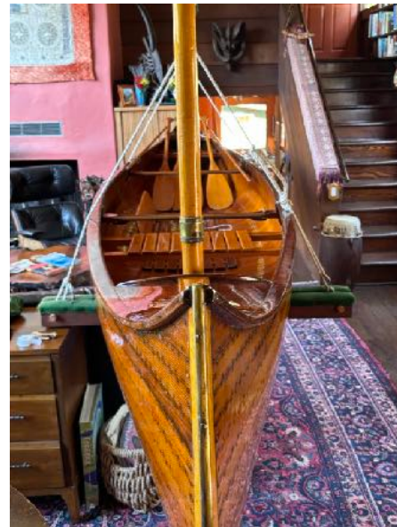
A Viking longboat?