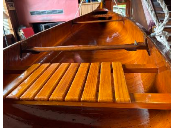
Interior looking aft